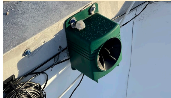
Sonic Call speaker